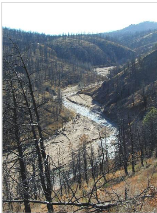
Erosion is evident in Spring Creek after the 1996 Buffalo Creek Fire.

Watershed steepness or ruggedness is an indicator of the relative potential for debris flows following wildfires. The more rugged the watershed, the more likely it is to generate debris flows. A combination of slope, road density (miles of road per square mile of watershed area), and other data were used as inputs to the flooding or debris flow risk portion of the analysis.