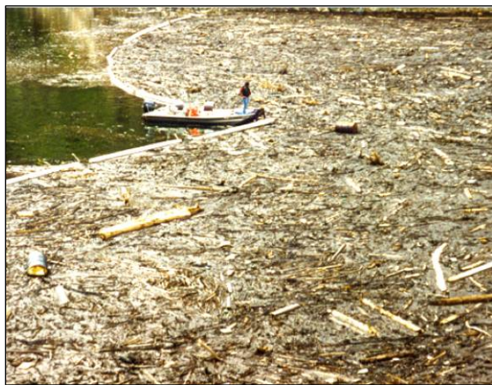
Debris flowed into Strontia Springs Reservoir after the 1996 Buffalo Creek Fire.

Surface water intakes, diversions, conveyance structures, storage reservoirs, and streams are all susceptible to the effects of wildfires. These structures have been identified for the Colorado Source Water Assessment completed by the Colorado Department of Public Health and Environment. These data were used to define which sixth-level watersheds contain water nodes that are critical components of the public water supply infrastructure. For the purpose of this methodology, water nodes were defined as coordinate points corresponding to the surface water intakes, upstream diversion points, and classified drinking water reservoirs.